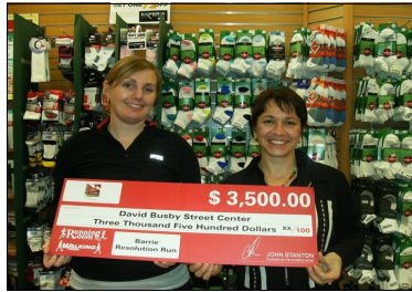
Barrie Running Room Annual Resolution Run