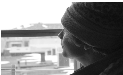
"Opposite ends of the Spectrum"

We wish to thank The Douglas Utting Foundation for believing in this project and funding our second annual "Visibly Unseen" which is scheduled to launch in May 2011 at Barrie's City Hall Rotunda.