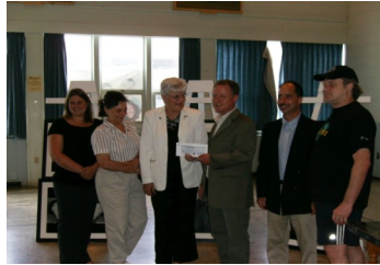
St. John Vianney Women's League donates proceeds from Church Bazaar