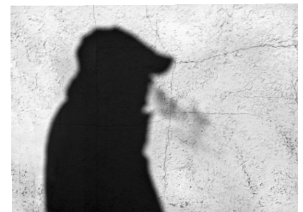
"This is not Dan"