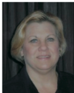
Mandy Hillyard Founder's Award