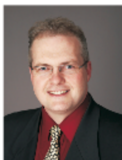
Mark Aitken Community Service Award