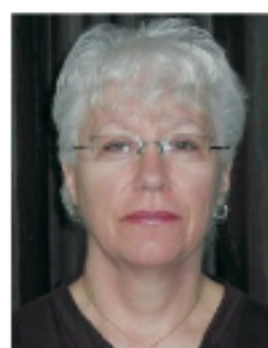
Joan Lafrance Volunteer of the Year Award

Please write your sponsorship message here: